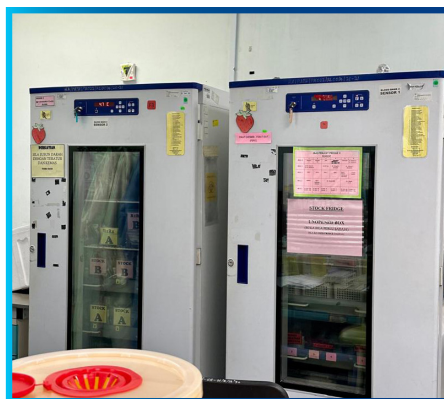
fig. Model U701